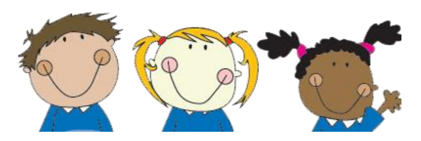
Question Will my child do well at Campton Academy?

At Campton Academy, we aim to ensure that all children are well-motivated and enthusiastic, enjoy school, have high aspirations and achieve their personal best in all areas of the curriculum. Respect, care and courtesy for others is actively encouraged and individuals are valued for their 'uniqueness'.